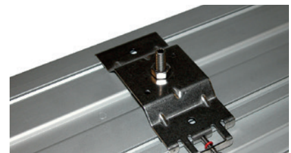
AS mounting system