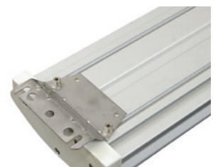
GL mounting system